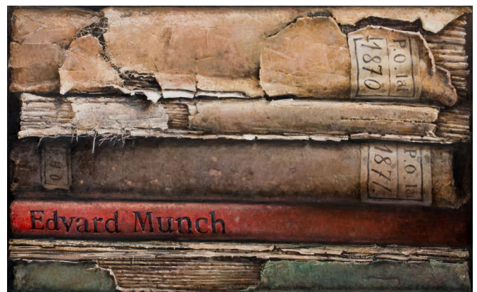
Hardbacks VI 2015 | Oil on Canvas | 97 x 130 cm (38 x 51 in)