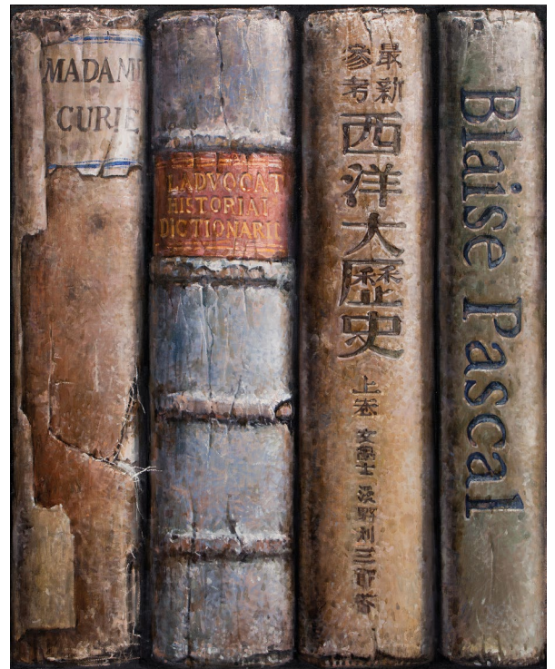
Hardbacks I (Triptych - Middle) 2015 | Oil On Canvas | 91 x 73 cm (36 x 29 in)