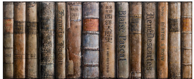
Hardbacks I (Triptych) 2015 | Oil on Canvas | each panel 91 x 73 cm (36 x 29 in)

The artist's subjects are objects of personal significance, part of his life's collection. They have, by virtue of his obsessive and highly skilled attention, become containers for expansive ideas about the importance of memory and the value of history in its many interpretations. These pieces suggest we look over our shoulders before moving on.