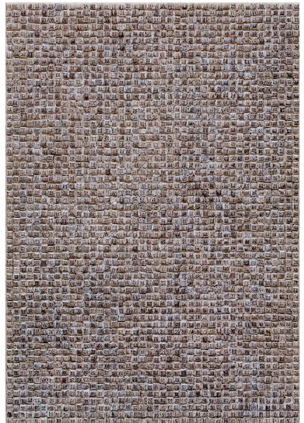
Type I 2015 | Mixed Media | 122 x 84 cm (48 x 33 in)