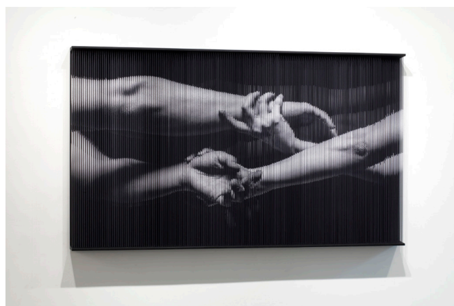
String Hands 0325 2014 | Mixed Media | 112 x 200 x 13 cm (44 x 79 x 5 in)