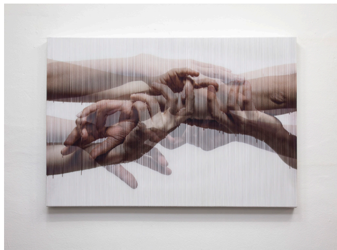
String Hands 005 2014 | Strings on Canvas | Edition of 3: 80 x 117 cm (31.5 x 46 in)