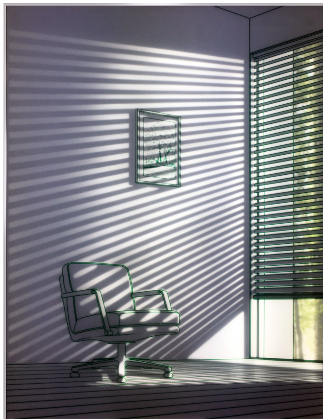
The Sunshine Room (2)

Tempered Glass, Sandblast & LED Backlit | 80 x 102 x 4 cm (31.5 x 40 x 1.5 in) | 2016