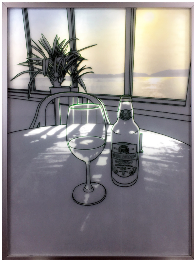
The Sunshine Room Tempered Glass, Sandblast & LED Backlit | 68 x 51 x 4 cm (27 x 20 x 1.5 in) | 2016