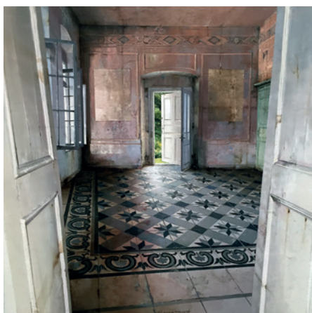
La Stanza Rosa | 2016 Oil and Mixed Media on Board | 40 x 40 cm (16 x 16 in)