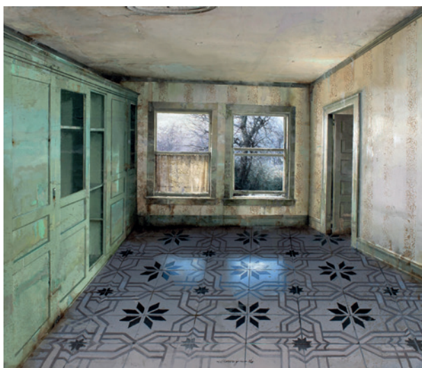
Inverno | 2015 Mixed Media on Board | 60 x 70 cm (24 x 27.5 in)