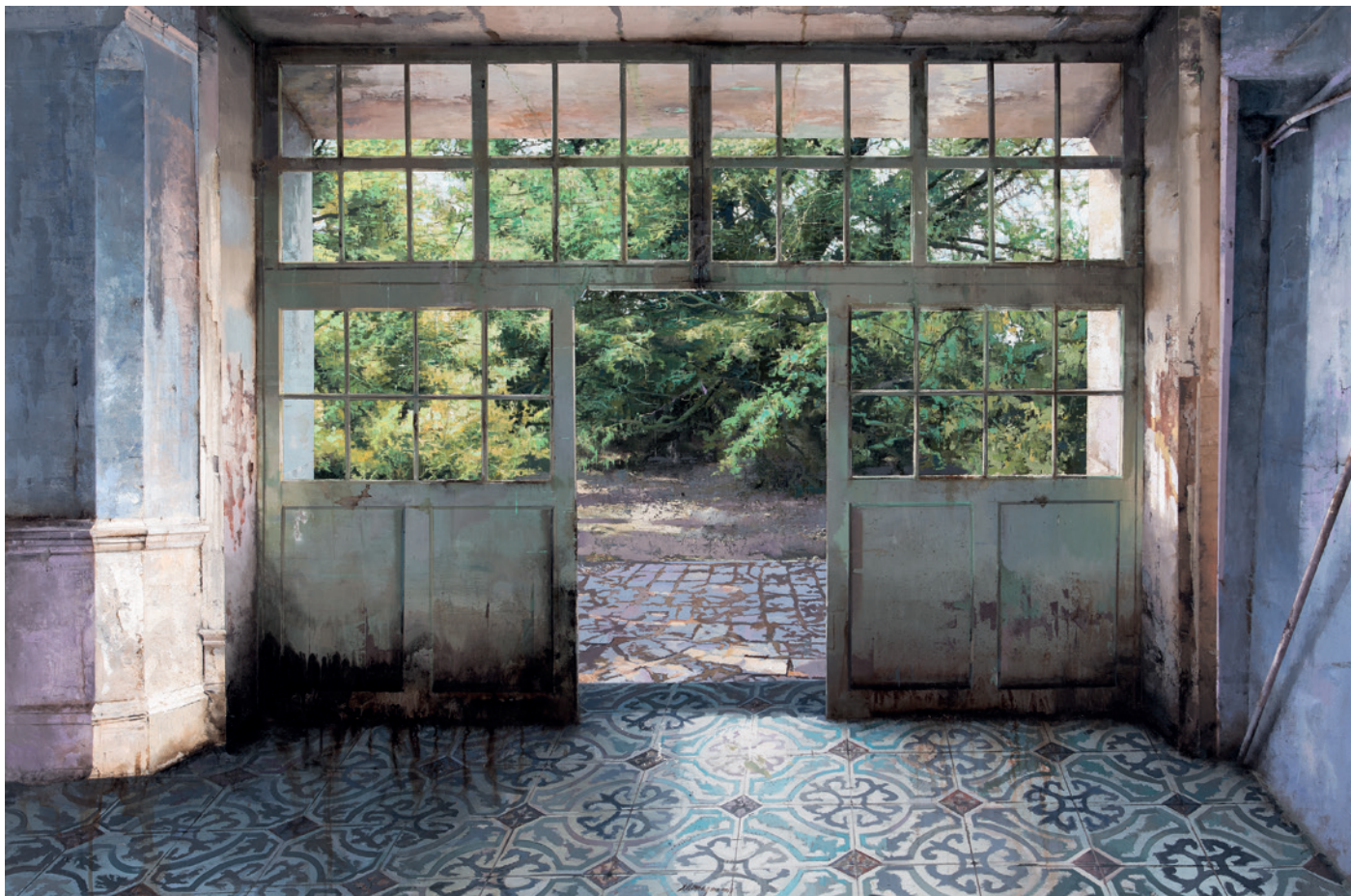
August | 2015 | Mixed Media on Board | 100 x 150 cm (39 x 59 in)

30 September – 23 October 2016 | Opening reception 29 September | 6–8 pm