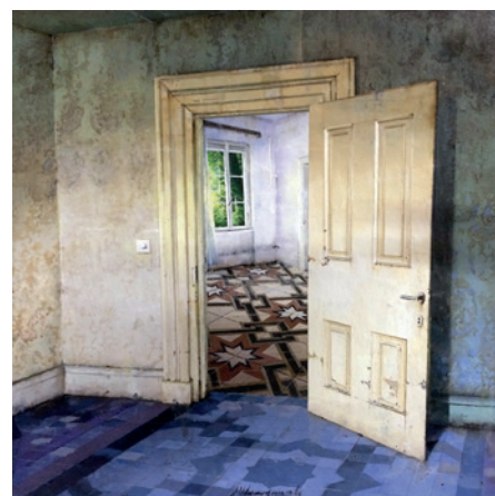
Interno 1 | 2015 Mixed Media on Board | 30 x 30 cm (12 x 12 in)