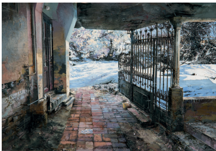
Veranda | 2015 Oil and Mixed Media on Board | 23 x 33 cm (9 x 13 in)