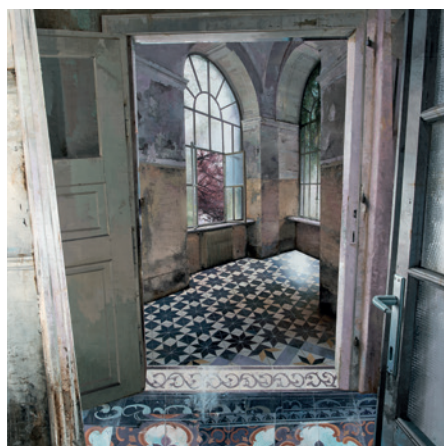
Room At The Corner | 2016 Mixed Media on Board | 150 x 150 cm (59 x 59 in)