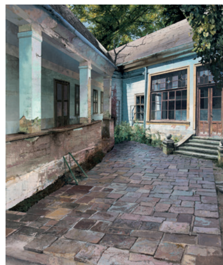
Pavement in the Garden | 2016 Mixed Media on Board | 120 x 100 cm (47 x 39 in)