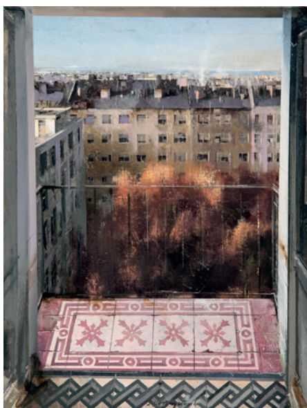
Balcony | 2015 Mixed Media on Cardboard | 40 x 30 cm (16 x 12 in)