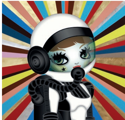
Astronaut in Solar System Portrait | 2016 Genuine Gold and Silver Leaf Plated on Ultra Chrome Ink Printed Paper | 104 x 110 cm (41 x 43.5 in)