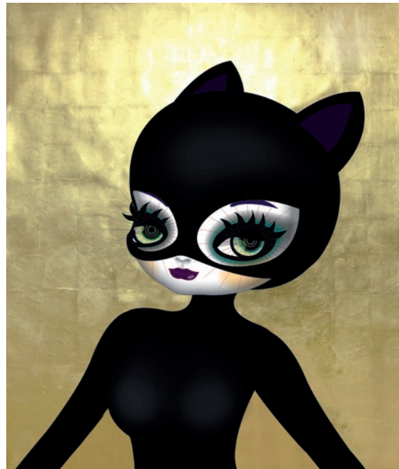
Cat Woman in Solar System | 2016 Genuine Gold Leaf Plated on Ultra Chrome Ink Printed Paper 130 x 110 cm (51 x 43.5 in)

If this is an artist for whom the surface is all, she has some interesting things to say about what that surface reveals to us.