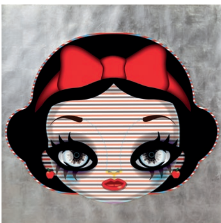
Snow White Extreme Galaxy Mix | 2016 Genuine Silver Leaf Plated on Ultra Chrome Ink Printed Paper 110 x 110 cm (43.5 x 43.5 in)