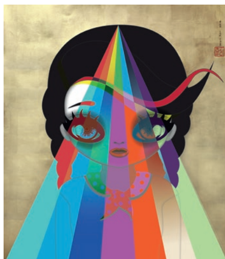
Rainbow Walks for the Destiny Solar Mix | 2016 Genuine Gold Leaf Plated on Ultra Chrome Ink Printed Paper 126 x 110 cm (49.5 x 43.5 in)