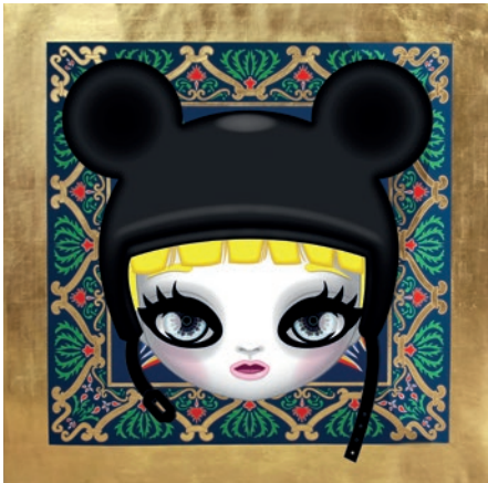
Dan Chung Solar Mix | 2016 Genuine Gold Leaf Plated on Ultra Chrome Ink Printed Paper 110 x 110 cm (43.5 x 43.5 in)