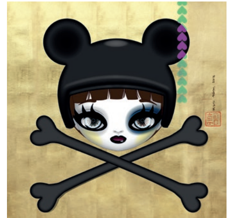
Romance in Pessimism Solar Mix | 2016 Genuine Gold Leaf Plated on Ultra Chrome Ink Printed Paper 80 x 80 cm (31.5 x 31.5 in)