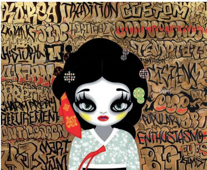
Concubine Solar Mix 1 | 2016 Graffiti Mix on Gold Leaf Plated on Ultra Chrome Ink Printed Canvas 130 x 163 cm (51 x 64 in)