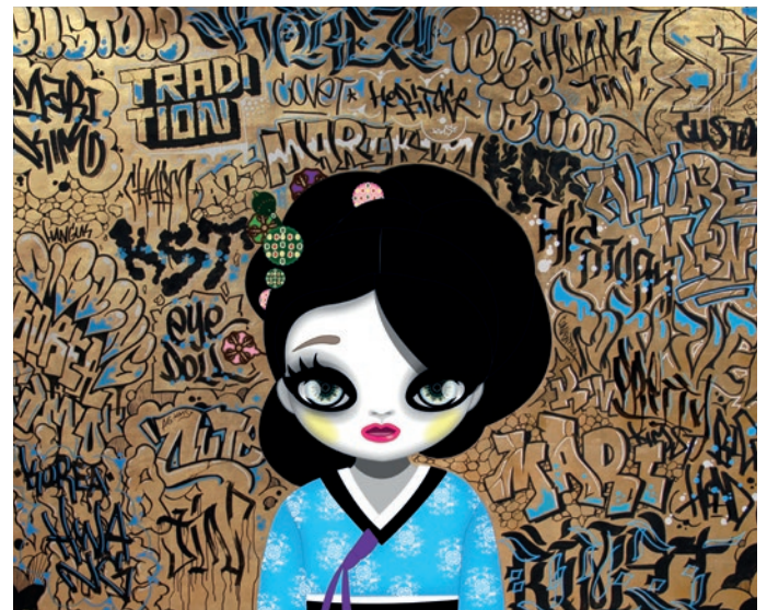
Concubine Solar Mix 2 | 2016 Graffiti Mix on Gold Leaf Plated on Ultra Chrome Ink Printed Canvas 130 x 163 cm (51 x 64 in)