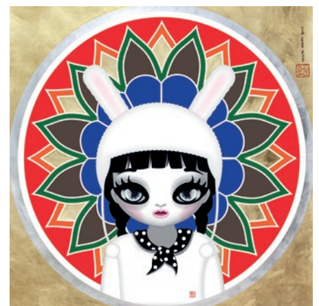
Korean Rabbit Solar Mix | 2016 Genuine Gold Leaf Plated on Ultra Chrome Ink Printed Paper 110 x 110 cm (43.5 x 43.5 in)