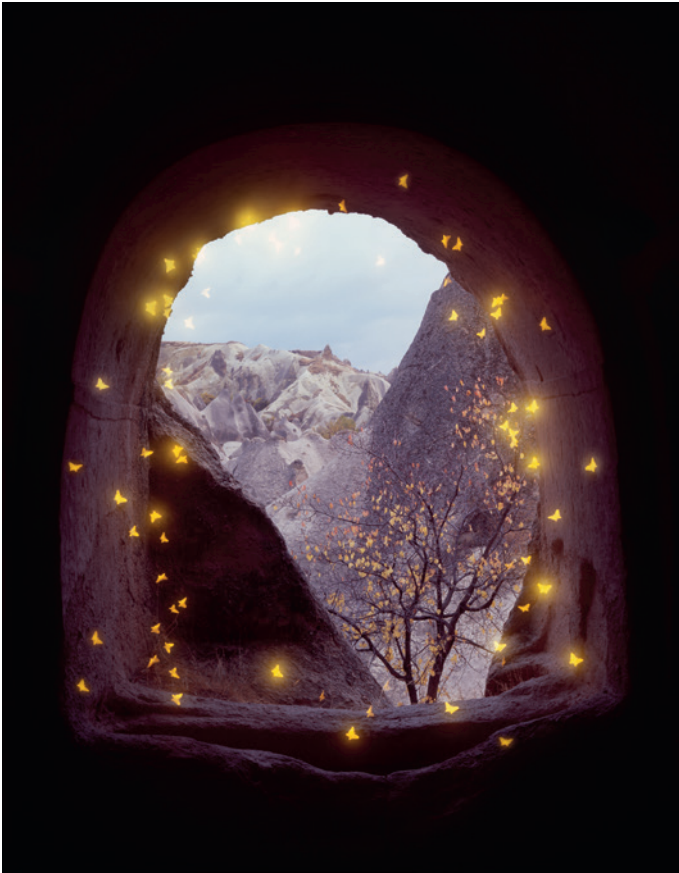
Nabi 127 | 2016 C-Type Print | Edition of 7 + AP 2: 160 x 120cm (63 x 47in) Edition of 10 + AP 2: 120 x 90cm (47 x 35.5in)