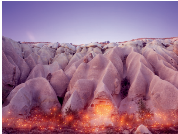
Nabi 122 | 2016 C-Type Print | Edition of 7 + AP 2: 120 x 160cm (47 x 63in) Edition of 10 + AP 2: 90 x 120cm (35.5 x 47in)