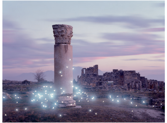
Nabi 128 | 2016 C-Type Print | Edition of 7 + AP 2: 120 x 160cm (47 x 63in) Edition of 10 + AP 2: 90 x 120cm (35.5 x 47in)