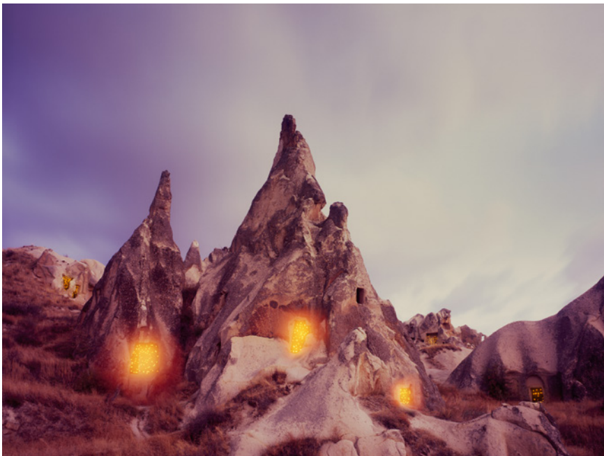
Nabi 124 | 2016 C-Type Print | Edition of 7 + AP 2: 120 x 160cm (47 x 63in) Edition of 10 + AP 2: 90 x 120cm (35.5 x 47in)