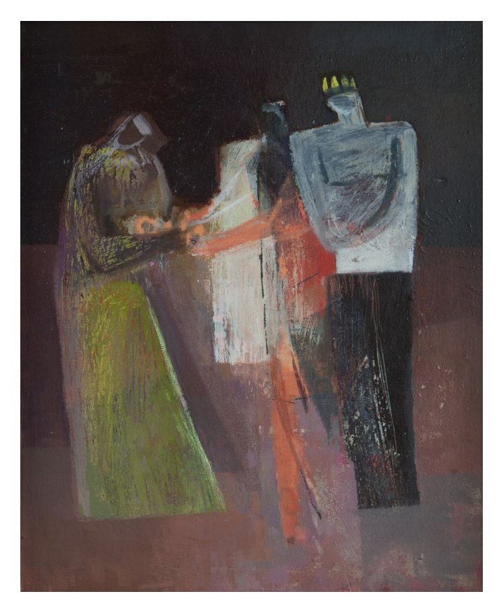
The Judgment of Solomon II | 2018 | Oil on canvas | 40 x 33 cm (15.5 x 13 in)

The story of Icarus is a recurrent theme. His falling image features in several paintings, operating as both symbol and compositional device. The paintings are theatrical. Subjects are arranged and displayed in a painted arena, a dramatic space in which to promote varying themes, typically of human encounter, interaction and solitude. This is where the artist lays out and considers the 'intimate relationships and emotional states' important to her.