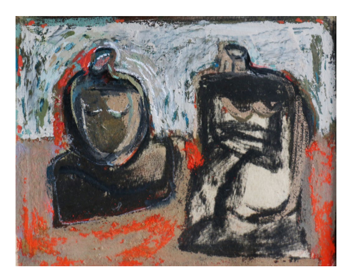
Conversation | 2018 | Mixed media on paper | 14 x 19 cm (5.5 x 7.5 in)