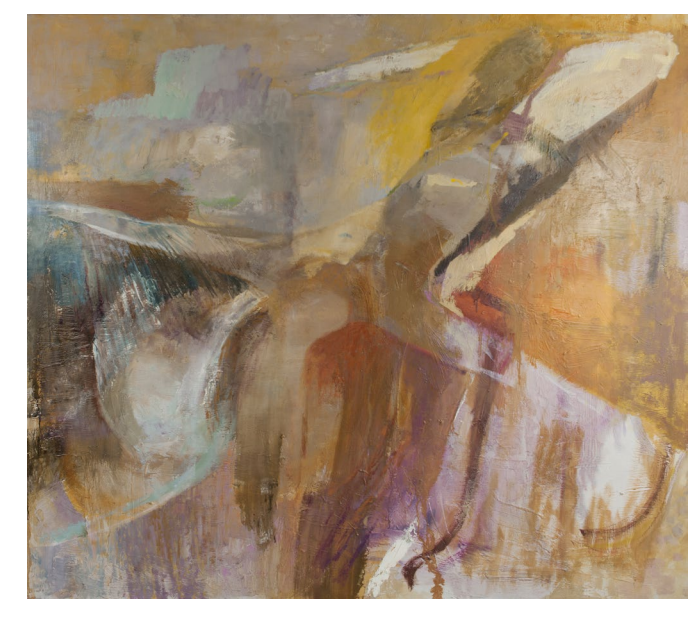
Discovering Icarus | 2018 | Oil on canvas | 152 x 172 cm (60 x 67.5 in)