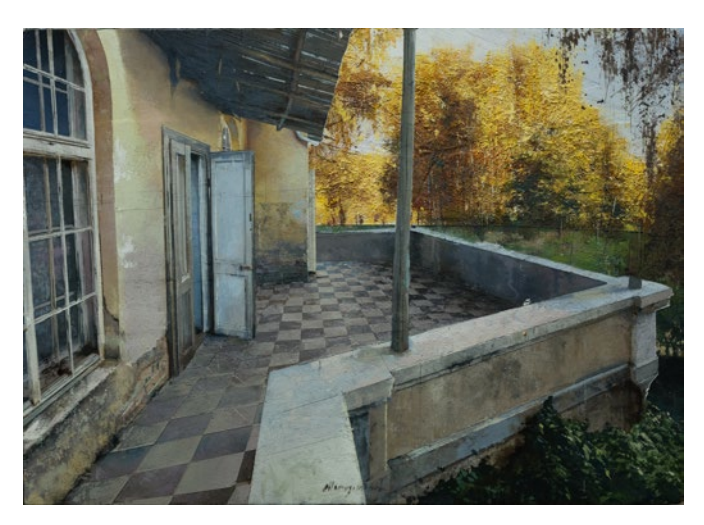
La terrazza di ponente | 2018 | Oil and mixed media on board | 23 x 33 cm (9 x 13 in)

The interlocking rooms and corridors, the backlit interiors, and the diverse geometric patterns of the floor tiles, are reminiscent of 17th-century Dutch painting. He combines the linear perspective and strict space-construction of Renaissance painting with an early 20th century, modernist treatment of space. He uses both cold and warm lights, which now bring out, now blur, the sharp contours, and radiating from all directions, make the colours glow. All these effects create a rhythm for the painting as Massagrande harmonizes the manner in which Vermeer and the Venetian masters treated light with the heritage of 20th-century Italian painting. What Matteo Massagrande performs is a systematic series of painterly experiments, probing into space, colour, perspective and light. Every one of his works is marked by the desire to articulate an original visual system that stems from classicist principles. This is the ultimate value of his painting and full expression of his artistic philosophy.