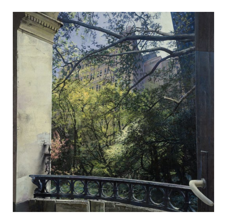
Maggio a New York | 2018 | Oil and mixed media on board | 60 x 60 cm (23.6 x 23.6 in)

exhibition dedicated to the European Impressionists L'età di Courbet e Monet, curated by Marco Goldin, Villa Manin, Passariano di Codroipo