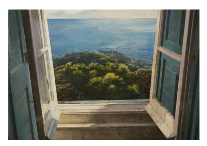
La finestra di Piero | 2018 | Oil and mixed media on board | 23 x 33 cm (9 x 13 in)