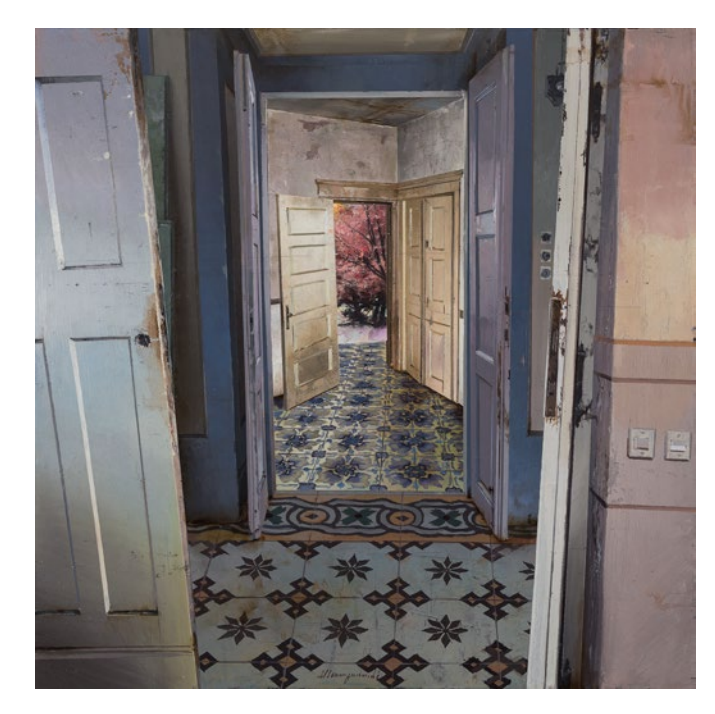
Albero rosso | 2018 | Mixed media on board | 40 x 40 cm (15.7 x 15.7 in)