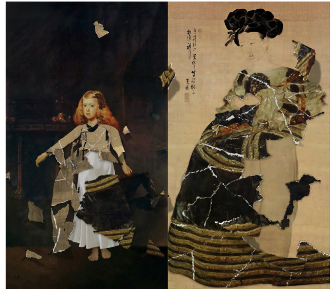
Miindo, Velazquez and Some Ants | Two 55" LED TVs | 4m 50s | 2011