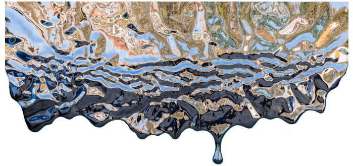
Monumental Melt | Mirrored Stainless Steel | 150 x 350 cm (59 x 138 in) | 2016