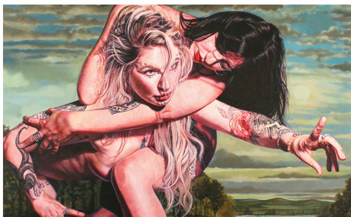
Missing One Who Never Was | 2023 | Acrylic on board | 42 x 59.5 cm (16.5 x 23.4 in)