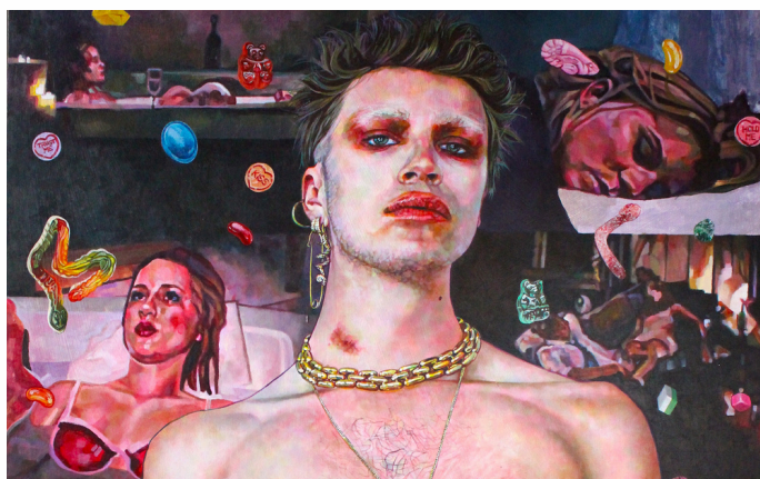
The Scarry | 2023 | Acrylic on board | 82 x 59 cm (32.3 x 23.2 in)