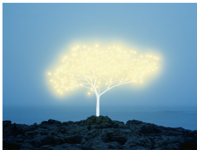
Tree of Life in Island 5-1-4 | C-type print | 120 x 160 cm (47 x 63 in) | 2013