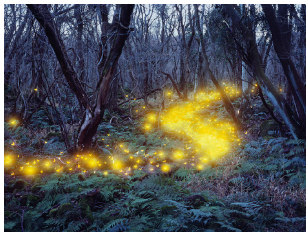
Nabi 07 | C-type print | 120 x 160 cm (47 x 63 in) | 2015