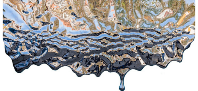
Monumental Melt | 2016 | Mirrored Stainless Steel | 150 x 350 cm (59 x 138 in)