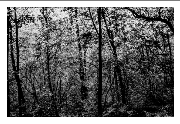
Emptiness – Ansan O2 | 2018 | LED Laminate | 97 x 145.5 x 8 cm (38 x 57 x 3 in)

Targetti Sankey S.P.A., Florence / VOA Associates, Inc., Chicago